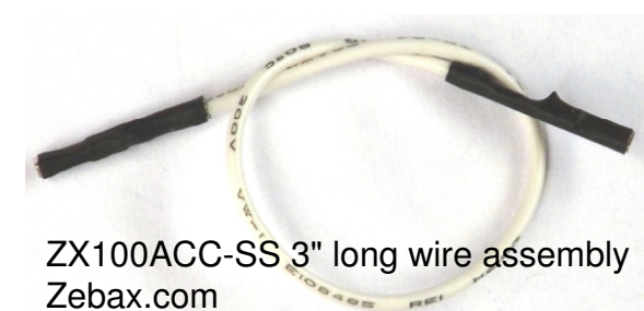
ZX100ACC-SS 3" long wire assembly Zebax.com